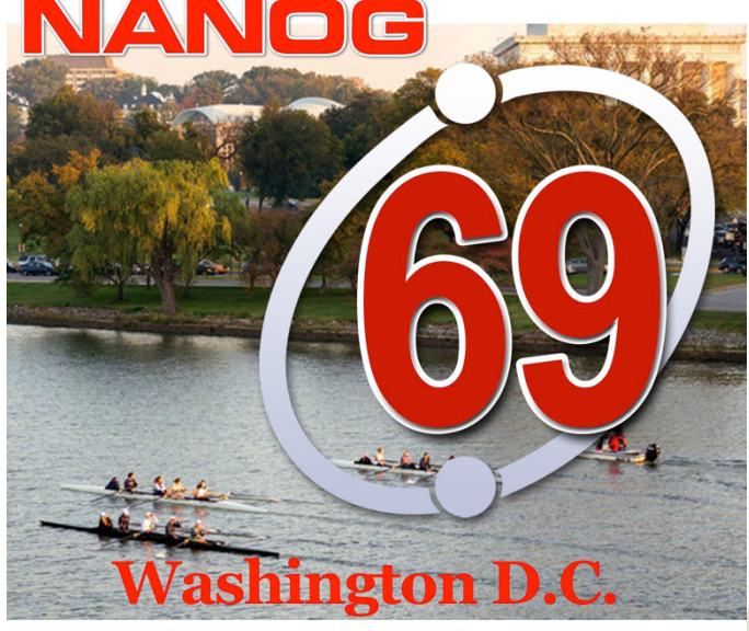
February 6 to February 8, 2017

NANOG 69 takes place on February 6-8, 2017 and will offer a great opportunity to network with colleagues, freshen-up skills, learn advanced networking techniques, and discover new network applications. NANOG 69 will be hosted by